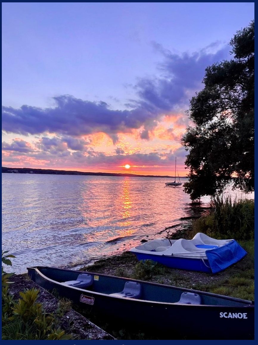
CLA Photo Contest submission