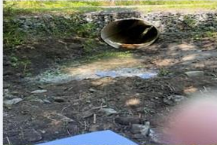
After on-site work photos:

Two Successful Grant applications with the Albany County Soil and Water Conservation Services